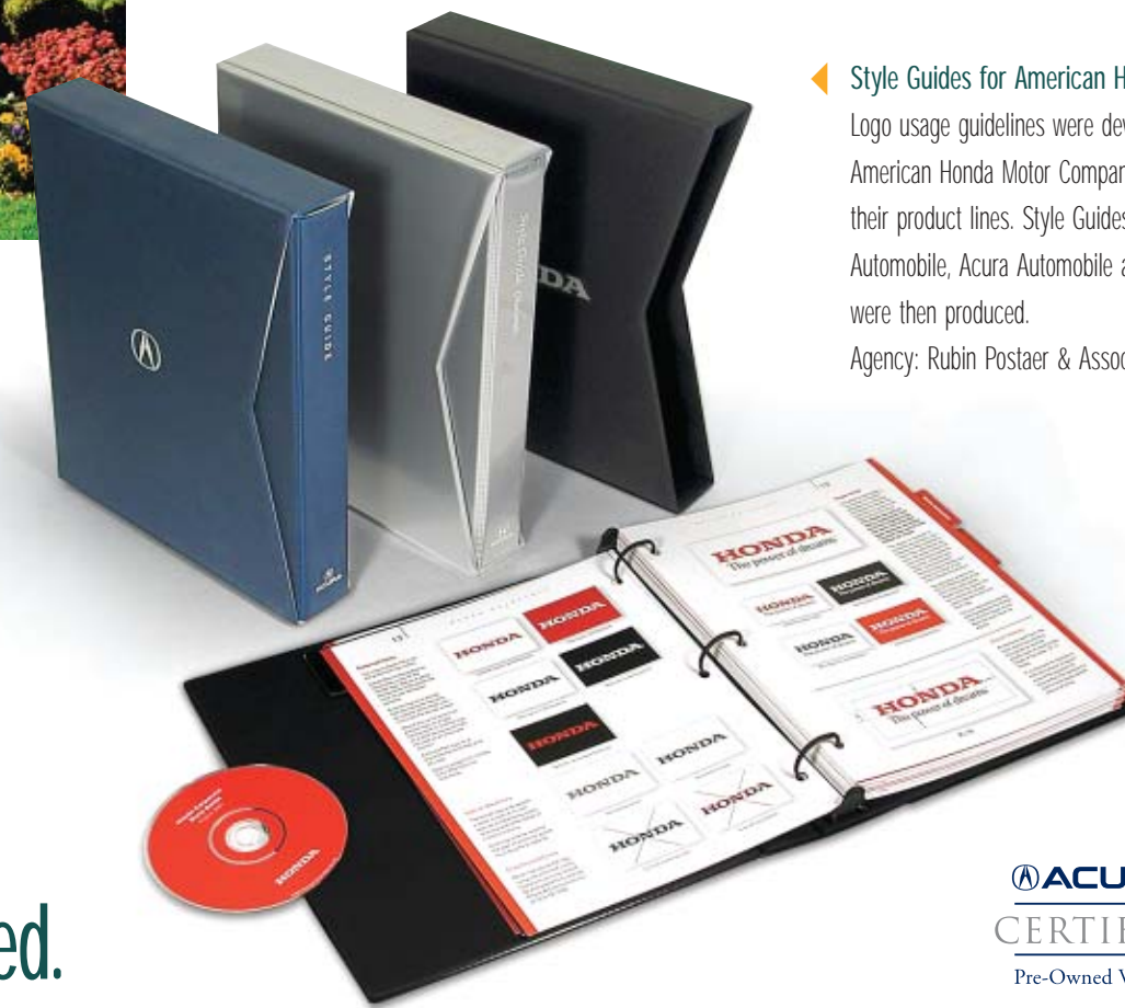
◀ Style Guides for American Honda Motors Logo usage guidelines were developed for American Honda Motor Company for each of their product lines. Style Guides for Honda Automobile, Acura Automobile and Corporate were then produced. Agency: Rubin Postaer & Associates