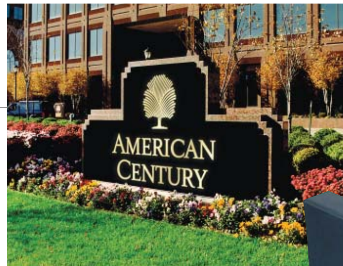
▶ Identity Created for American Century Lawson Design created the new trademark and graphic standards, stationery and business forms, new signage for headquarters and Investor Centers, as well as a new fund literature system and other identity-related assignments. Agency: Rubin Postaer & Associates